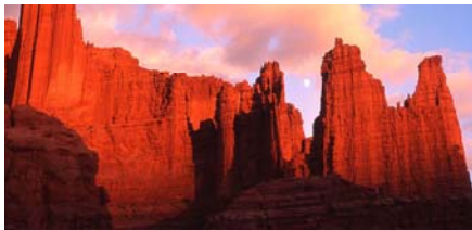
Fisher Towers in Southern Utah